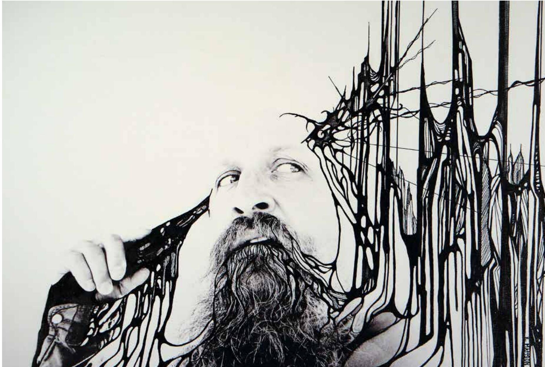
unfinished NFS, Mixed media 2020"