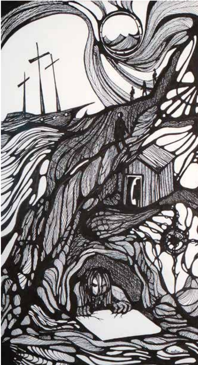
harvesters, Mixed media 2020"