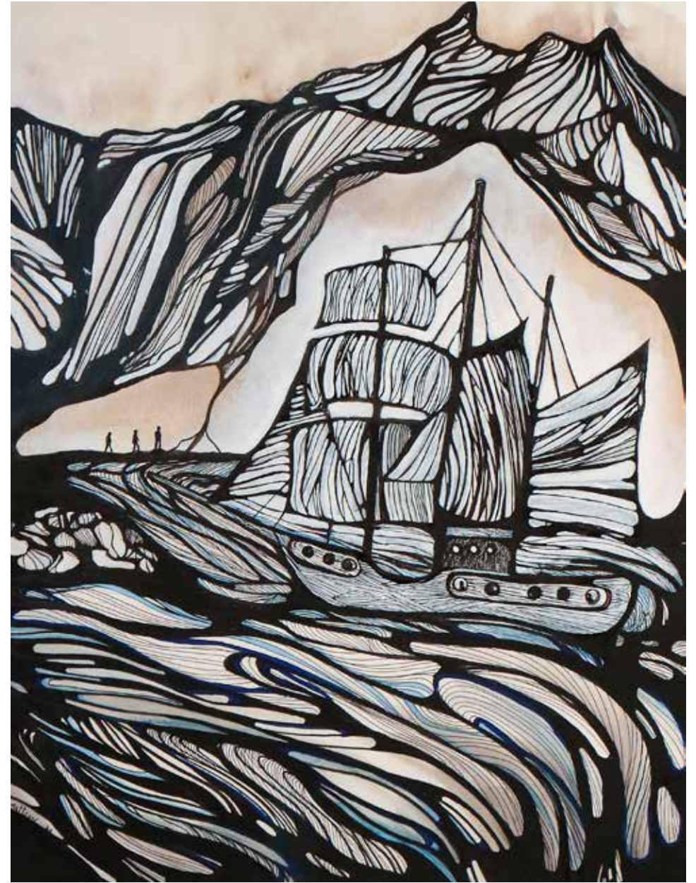
solstice, Mixed media 2020"