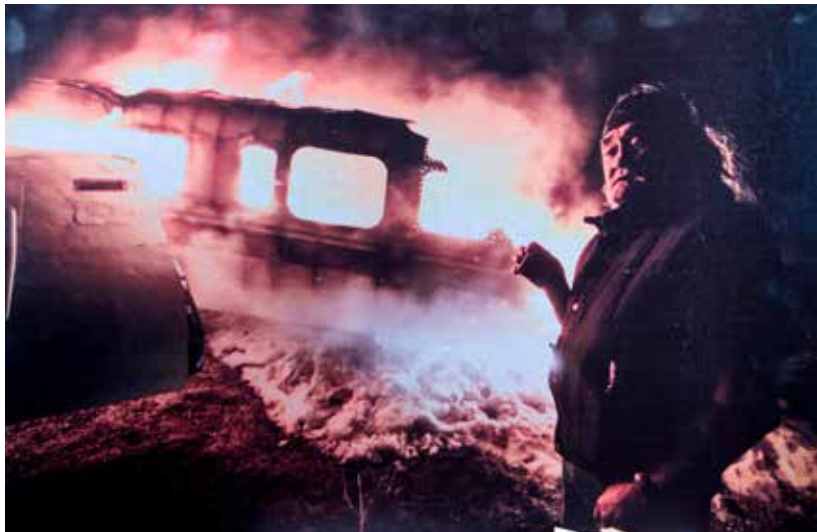
catharsis, Photograph 2020