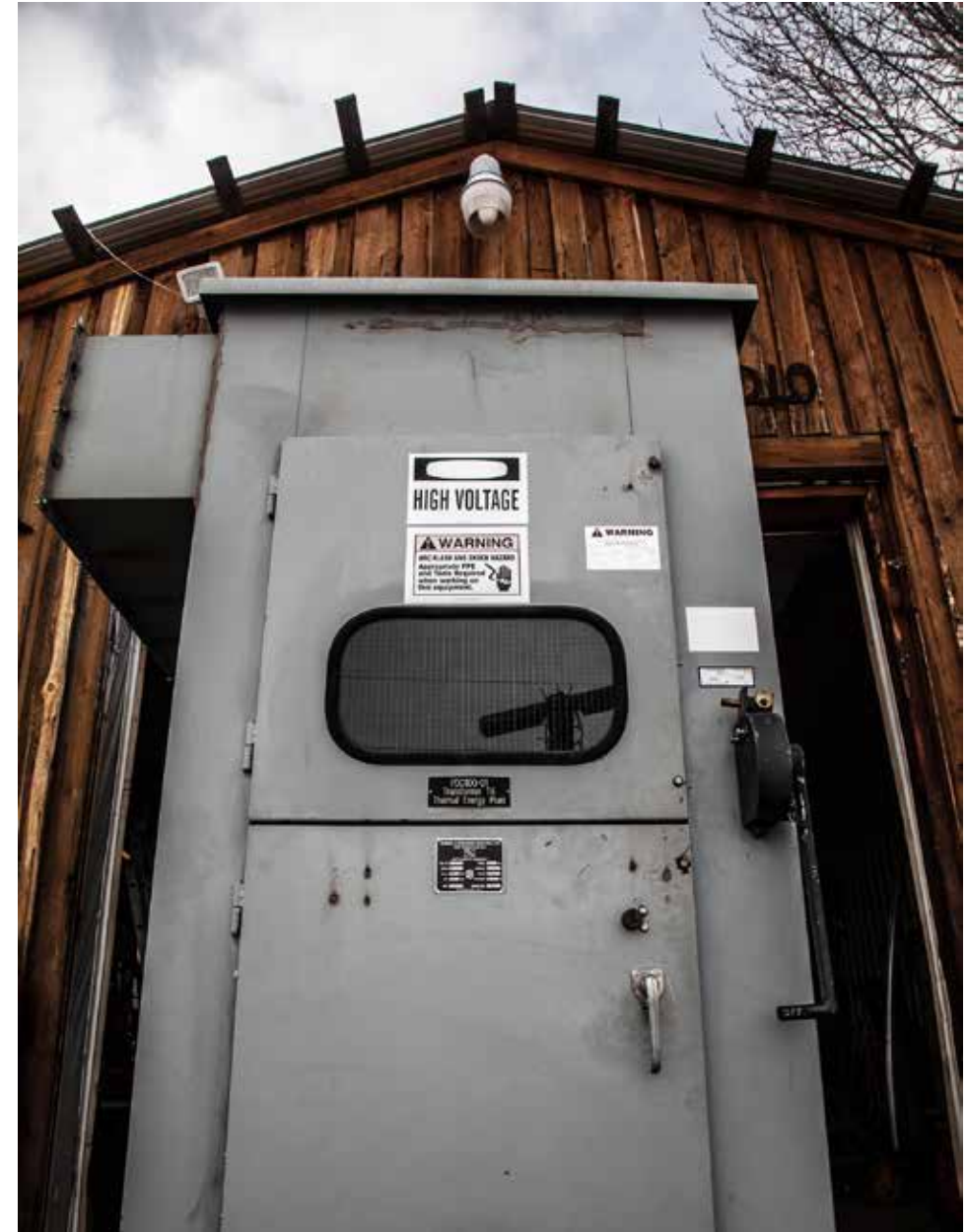
CHAMBER, Interactive installation 2020