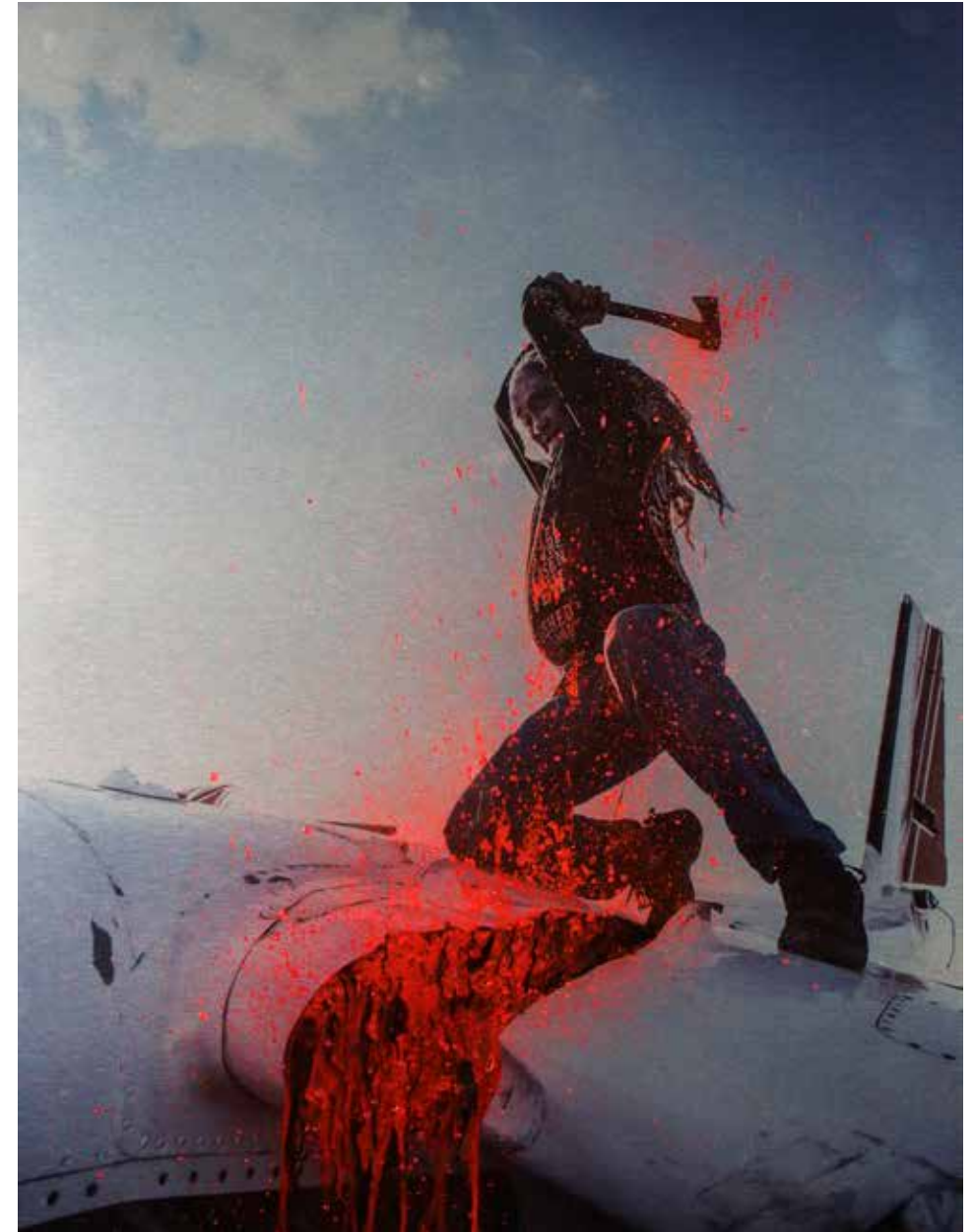
expulsion, Ink on photograph 2020